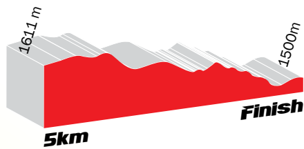
5km to Finish Profile